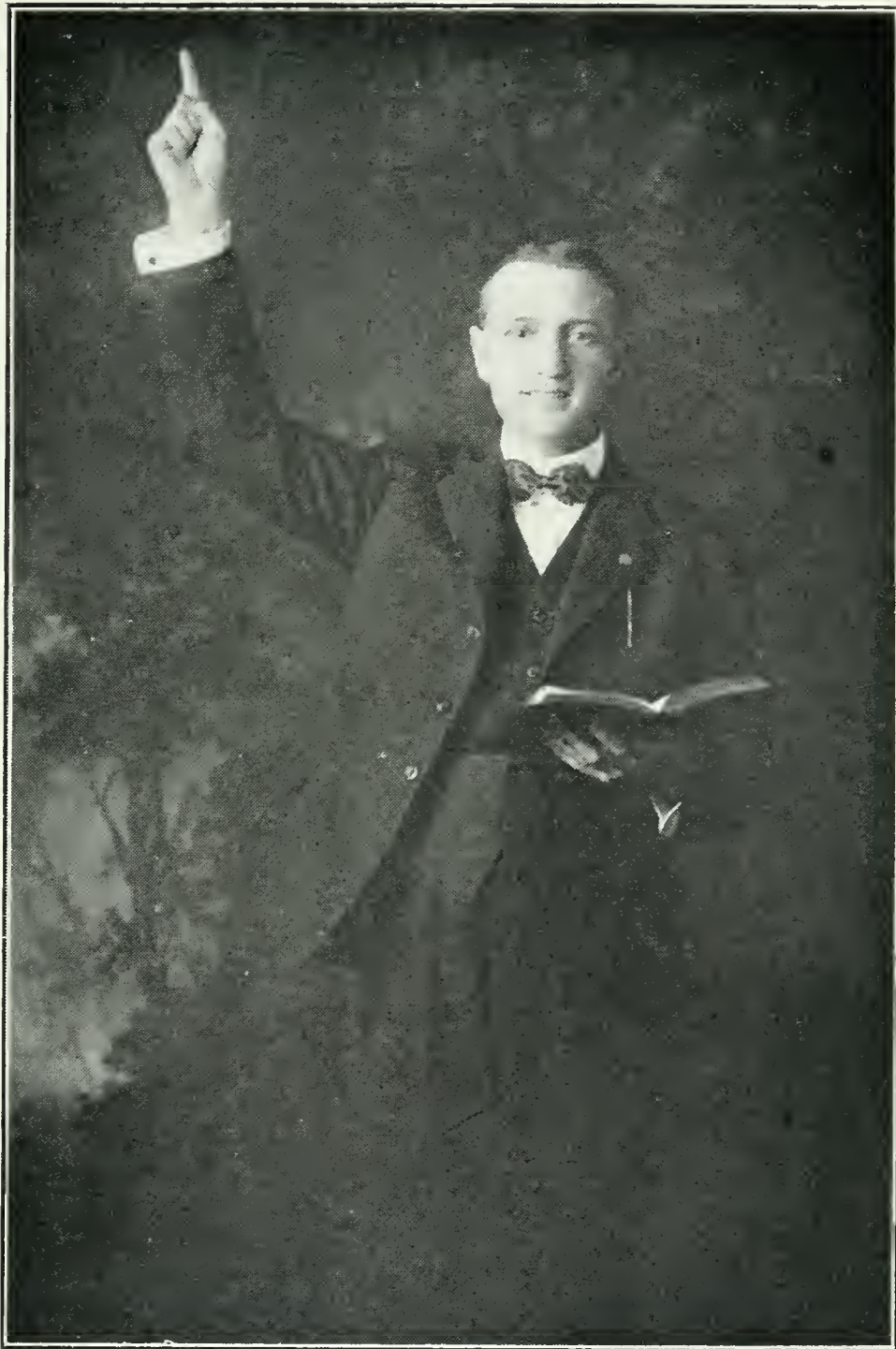
Pointing to Christ and Heaven