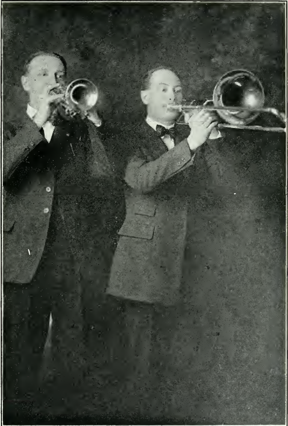
The Offertory Duet