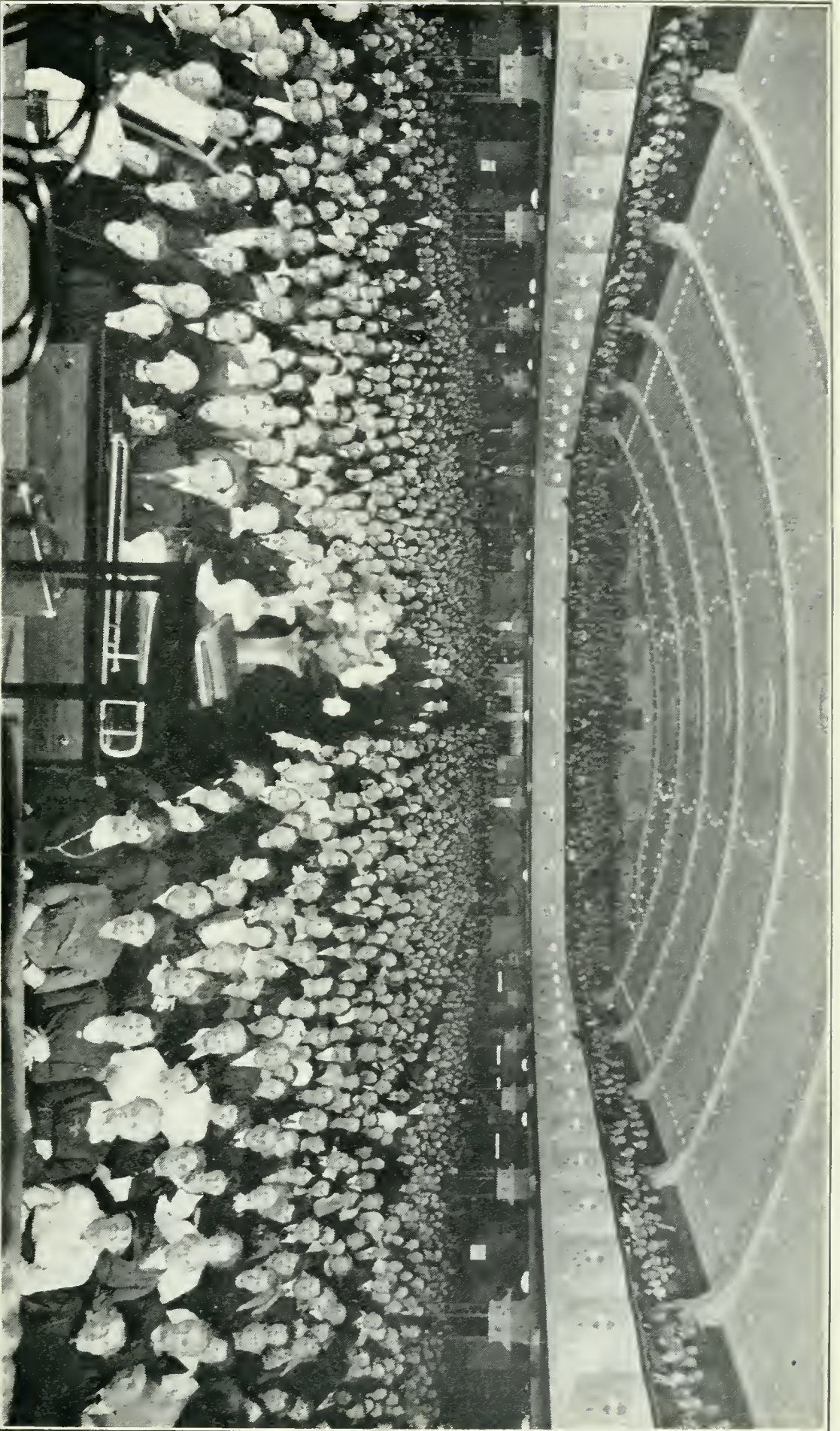
The Last Meeting of the Big Campaign, Arcadia Hall, Detroit, Mich., 1921