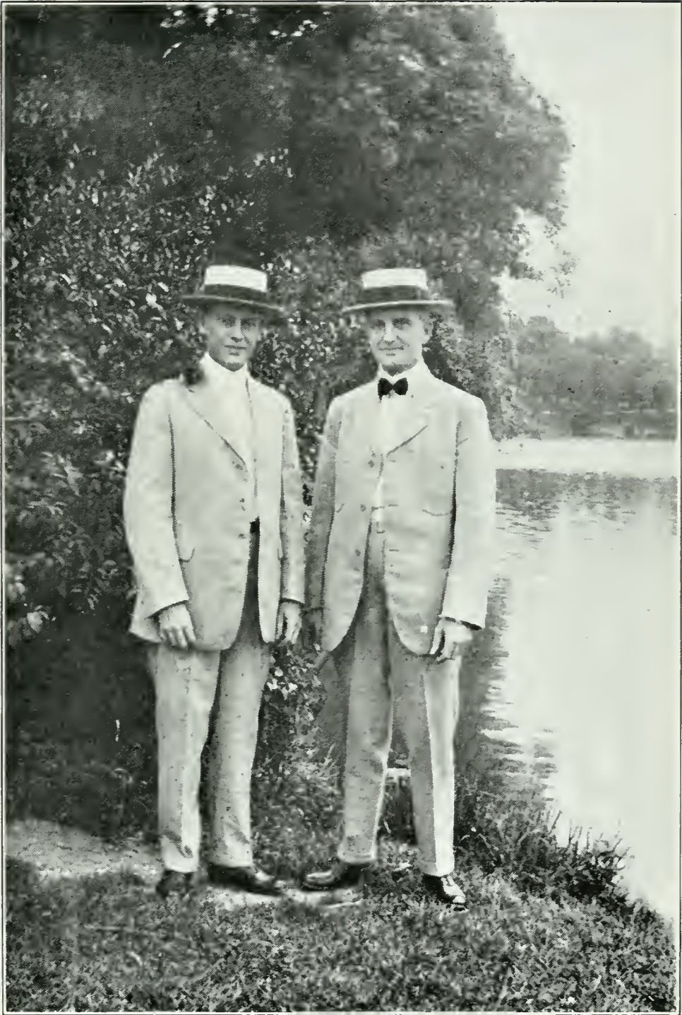
The Bosworth Brothers